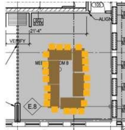
Bolz B meeting for 22 (room size 20 x 24)