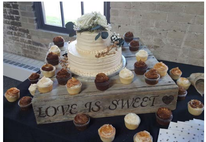
Cake or dessert service is $1.00 - $3.00 per person based on the service level you are interested in.

Chocolate Mousse . . . . . $3.95pp individually portioned with fresh berry garnish