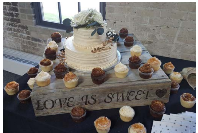
Cake or dessert service is $1.00 - $3.00 per person based on the service level you are interested in.

All food and beverages are subject to a 22% service fee, and 5.5% sales tax