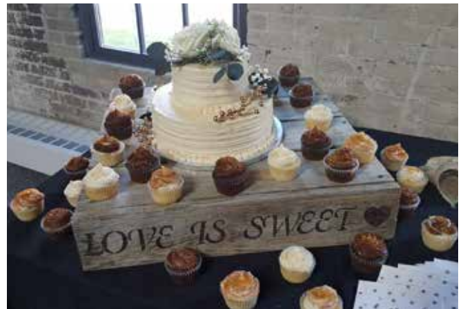
Cake or dessert service is $1.00 - $3.00 per person based on the service level you are interested in.

All food and beverages are subject to a 22% service fee, and 5.5% sales tax